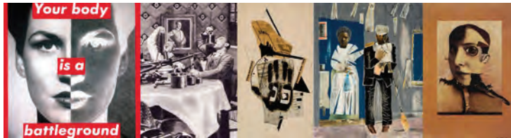
Images: (L-R): Barbara Kruger, Untitled (Your body is a battleground) , 1989, John Heartfield, Hurrah, die Butter ist alle! (detail), 1935, El Lissitzky, Shifs karta , 1922, Romare Bearden, The Family , 1969, Hannah Höch, Russische Tanzerin , 1928