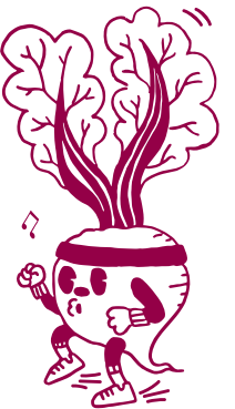
Drawing: Cesario Lavery

SUNDAY 6:30-7:30 AM MEET IN THE BON APPÉTIT TENT FOR COFFEE ROUTE TO BE DETERMINED